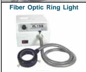
Fiber Optic Ring Light