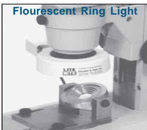
Flourescent Ring Light